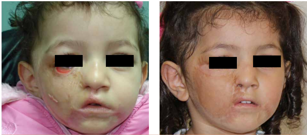
Figure 3. a, b. The girl was one year old when contact with a hot ironer inflicted a burn injury. She was initially treated by split-thickness skin graft. However, late contraction of the graft imposed ectropion of the lower eyelid and contracture of the lip (a). After total excision of the graft and release of the contractures influencing the mouth, the resultant defect was resurfaced with a combination of Matriderm® and split-thickness skin graft. Simultaneously, the ectropion was corrected by tarsal strip canthopexy. After this operation, there was a small healing problem in the lower eyelid region. The area was again reconstructed using the Matriderm combination. The two-year postoperative result is shown on the right (b). Although there is some inconsistency with the color, no further late contractures of the grafts occurred, and there were favorable results with the correction of the eyelid and oral commissure contractures

The average surface areas of the defects preoperatively and at one year after being grafted with Matriderm were 39.3 cm 2 and 35.5 cm 2 , respectively, with a statistically significant contraction rate of 9.6% ( p < 0.05 ) (Table I).