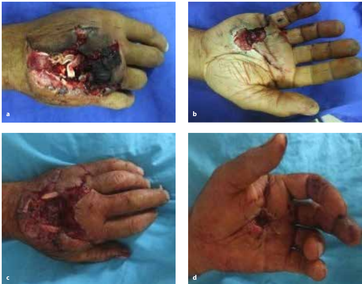
Figure 1. a-d. (a-b) Case 1, dorsal and volar aspect of the right hand with 4 th flexor digitorum superficialis tendon defect, 4 th metacarp defect, and 3 rd common branch of median nerve defect. (c-d) Case 9, dorsal and volar aspect of the left hand with 3 rd flexor digitorum superficialis tendon defect, 3 rd metacarp defect, and 3 rd common branch of median nerve defect

Data obtained about the patients, including age, gender, dominant or non-dominant hand, and injuries to all vital structures, were assessed, categorized, and recorded. All hand injuries had an entry point on the palmar surface and an exit point on the dorsal surface accompanied by tendon, vessel, nerve, bone, and soft tissue injuries, and skin defects of various sizes (Figure 1-3)