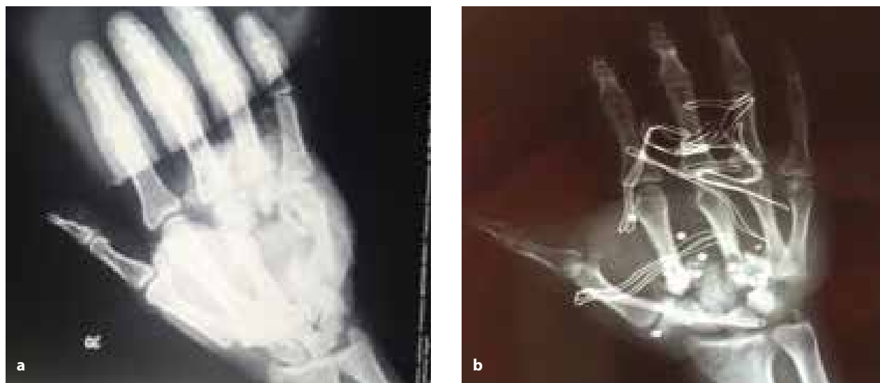
Figure 3. a, b. (a) Preoperative x-ray of the 4 th metacarpal defect. (b) Preoperative x-ray of the carpometacarpal bone defect with foreign bodies

Nine patients had right hand injuries and two had left hand injuries. Eight patients were injured in the dominant hand. The injured patients were first assessed in the emergency department. Because all wounds presented contaminated blast injuries, their management in the emergency department included careful irrigation and debridement in order to remove necrotic material. Wounds were closed with a single layer of nitrofurazone and rifampicin-containing gauze. All patients received appropriately positioned splints to maintain stability and preserve circulation. None of the patients had circulatory complications. Because all wounds were considered contaminated, parenteral broad-spectrum first-generation cephalosporin and metronidazole treatment was begun. Initial care was followed by surgical reconstruction during the acute period. All patients received their initial operation within 24 to 72 hours (average: 42 hours) of the gunshot wound.